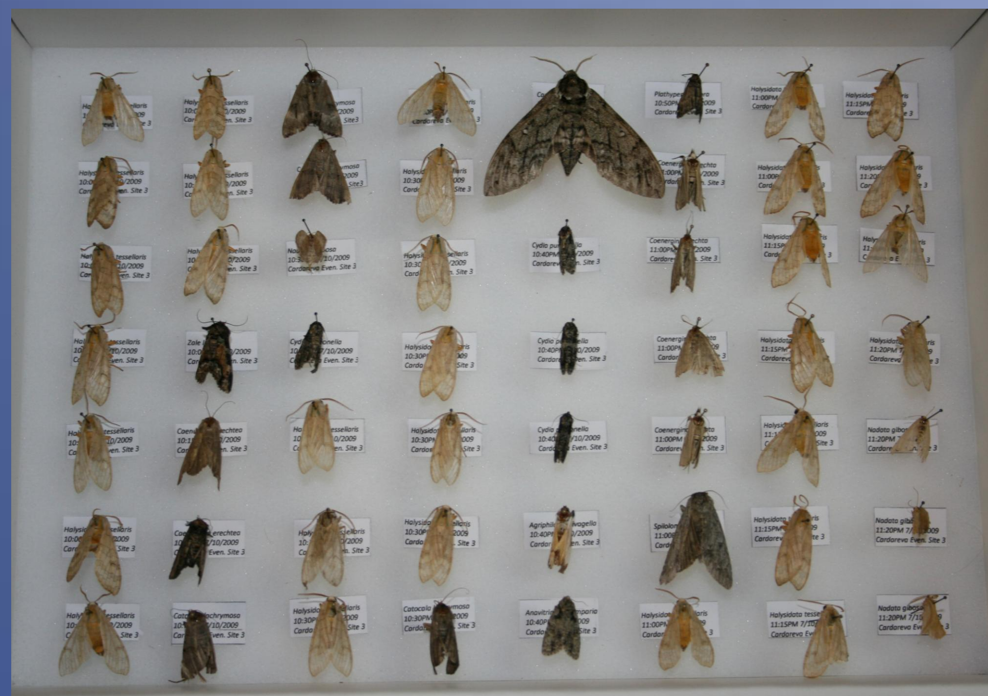
Specimens collected at Cardareva Even age